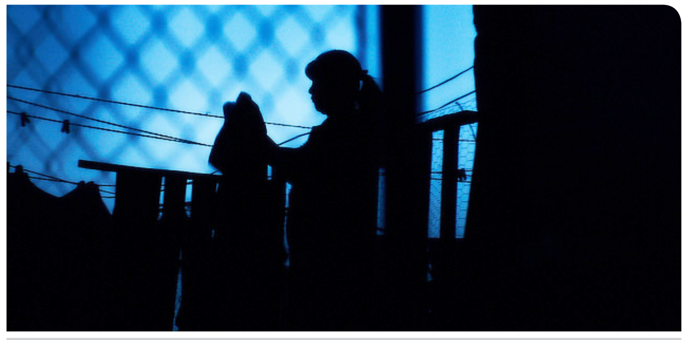
Photo 3: Woman hanging clothes out to dry in Mexico

In terms of the provision of protection services, the Belém Do Pará Convention obliges states to create mechanisms to provide direct, free and specialised assistance to victimized women. These services should include legal support, emergency phone lines, psychological support and health care. As an example of this strategy to improve the treatment of victims, countries implemented protocols to train healthcare personnel to detect violence against women and provide the right type of support (Rioseco Ortega 2005; Castillo & Prado 2010).