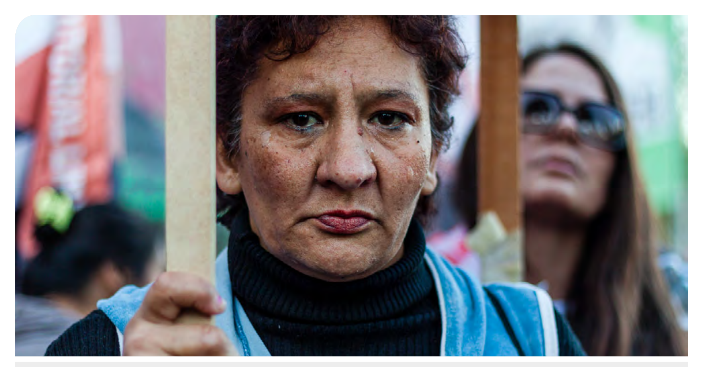
Photo 4: Woman marching as part of the #NiUnaMenos movement in Argentina