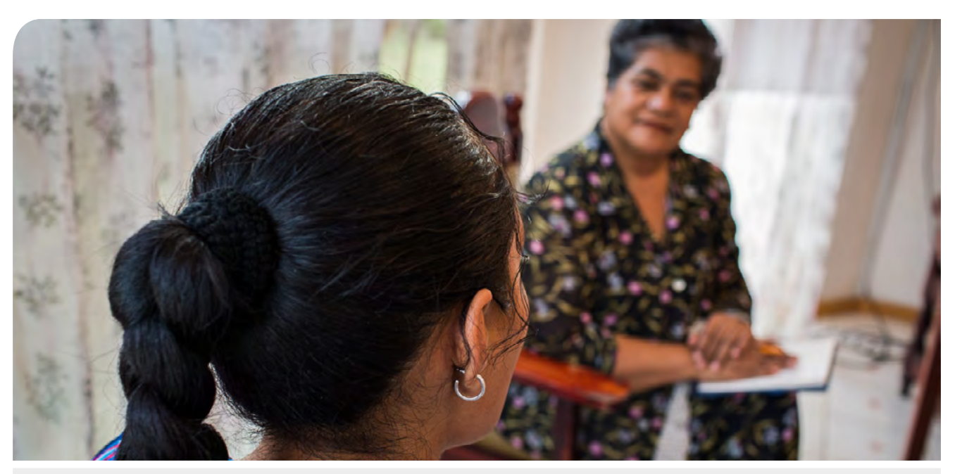
Photo 6: Counsellor at Tonga National Centre for Women and Children talks with a woman who has been the victim of domestic violence