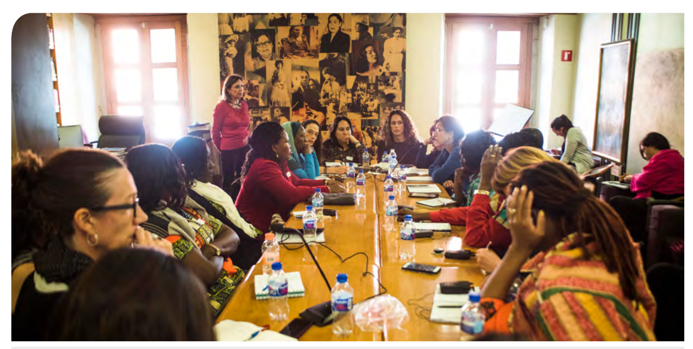
Photo 5: African and Latin American Experts meet in Mexico as part of the ELLA Programme study tour to share knowledge on how to combat domestic violence