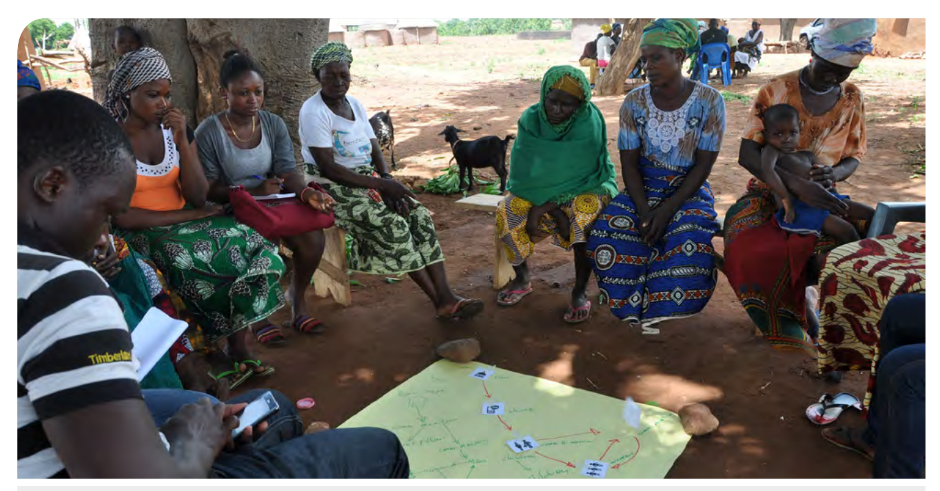
Photo 3: Women participating in a workshop in Ghana